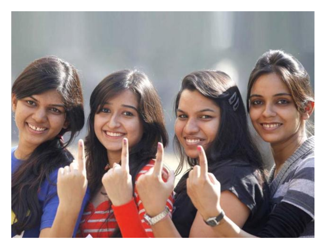
In this year's election, 48.6% of the eligible voters are women.