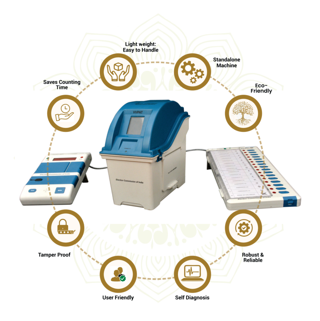
5.5 Mn Electronic Voting Machines (EVMs) will be deployed nationwide.